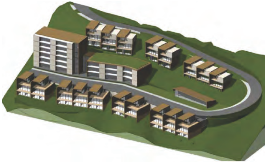
Mixed Condo & Townhouse Concept